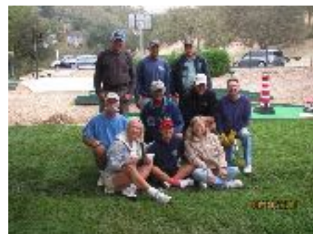
Volunteers laid sod at our NEW golfcourse. A drinking fountain, benches to sit on, BBQ, and tables under the new Pergola have also been added recently.