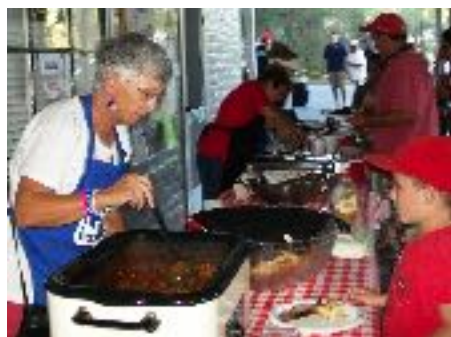
( I think the kids like to party with family at the community functions, like our Annual Labor Day BBQ, Bake Sale & Auction ! )