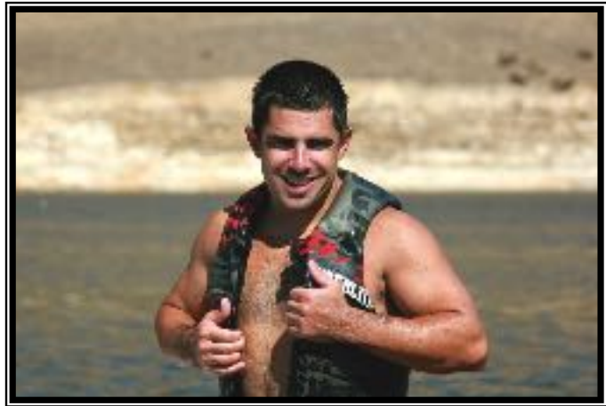
Shawn Wilson—Champion Wakeboarder Page 4