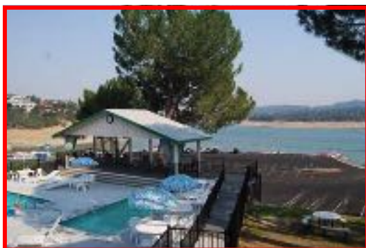
POOL AREA COMPLETED AND IS A SIGHT TO BEHOLD!!!