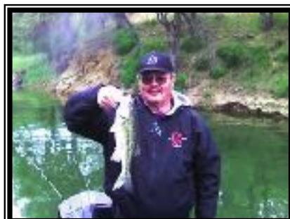
Don Reader Page 7