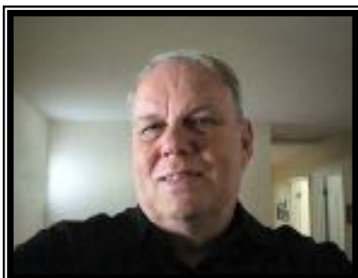
Jim Marshall Page 6