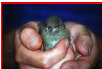
BABY BIRD FELL OUT OF NEST