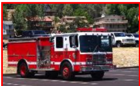
SAFETY DAY WAS HELD AND EXTREMELY IMPORTANT