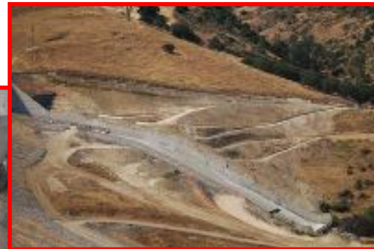
PASO ROBLES WATER PROJECT'S.....