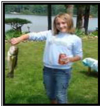
14th Annual Ron McKibben Memorial Kids Fishing Derby May 9th Page 7