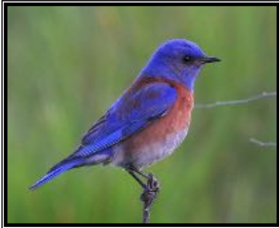
Learn About our Local Bluebird Page 8