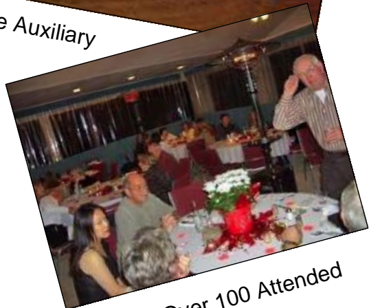
Over 100 Attended