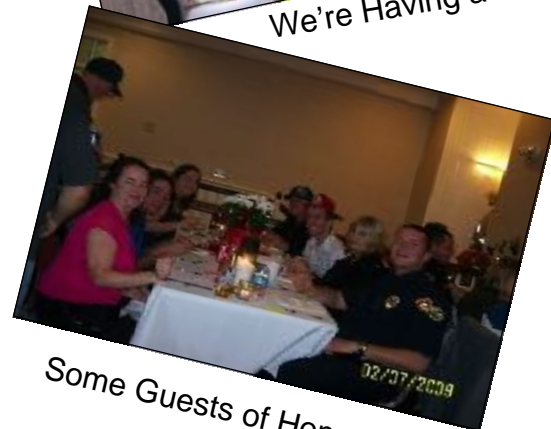
Some Guests of Honor