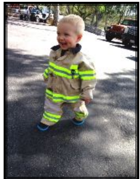
Oak Shores Fire Department Update Page 3