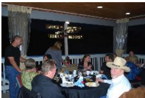
Good Time for All