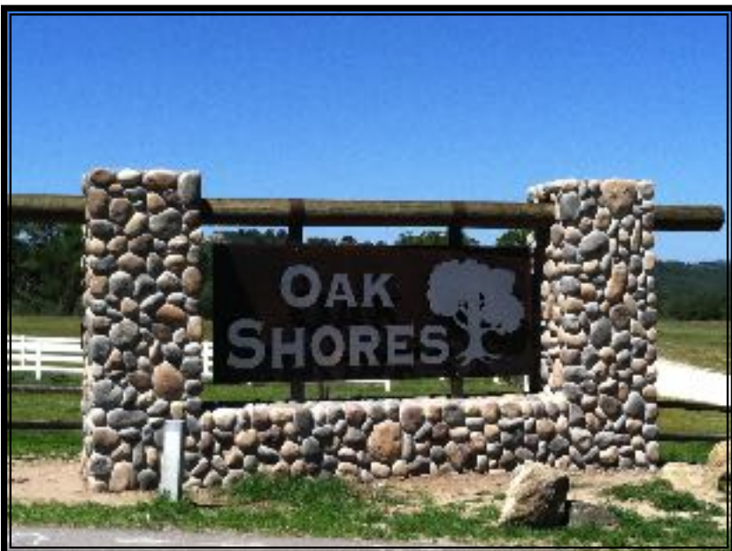
New Entrance Sign Completed Paid for by Recreation Committee, Logos & Beautification Committee