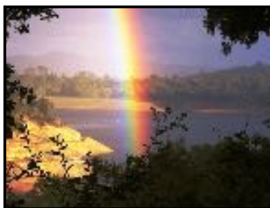
Rainbow over Us-by Bill Crum