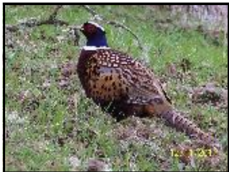
Pheasant in Oak Shores-Dick Fredericksen