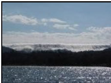
Fog Fingers