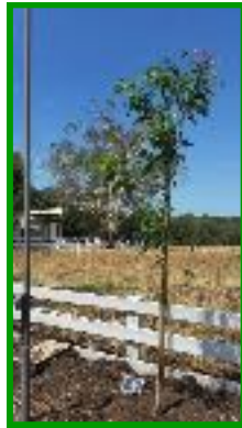
Trees with a Message