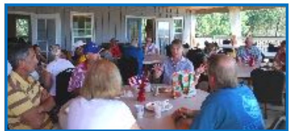
4th of July Annual Breakfast.....(not shown was the dance that night!)