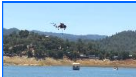
Deer Fire on south shore burned 150 acres-July