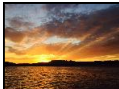
"YEAR" is done, Gone the sun, From the lake, From the hill, From the sky. All is well, Safely rest, God is nigh."