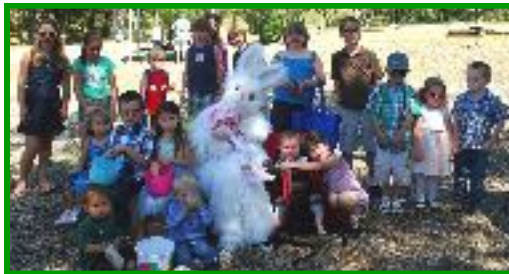
Easter Egg Hunt