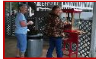
Movie Nights under the Stars