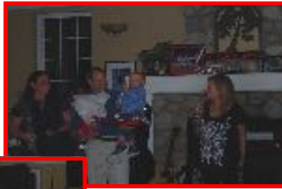
Fireman's Ball & Auction