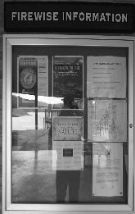
New FireWise Bulletin Board at the Clubhouse Check it out!